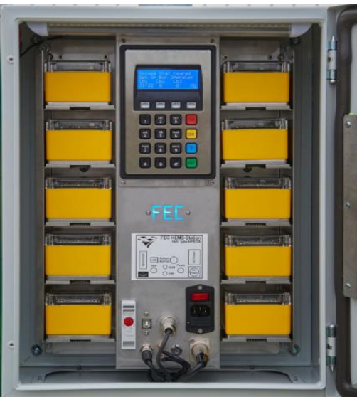
The Glenforsa Community Night Operational Temporary Landing Site, illuminated by the FEC HEMS-Station® system, provides a 24/7/365 critical care service on the Isle of Mull

FEC HEMS-Station® Solar Plus can be installed and operationally ready within 3 days. It provides a re-locatable, semi-permanent heliport lighting solution that can be implemented almost anywhere in the world, due to its solar power mains autonomy. The HEMS-Station® Solar Plus houses 10 HEMS-Star® portable lights in an IP65 rated secure cabinet, has VHF, UHF & SMS connectivity, comes with portable LED internally illuminated WDI, resulting in an economical yet fully compliant low